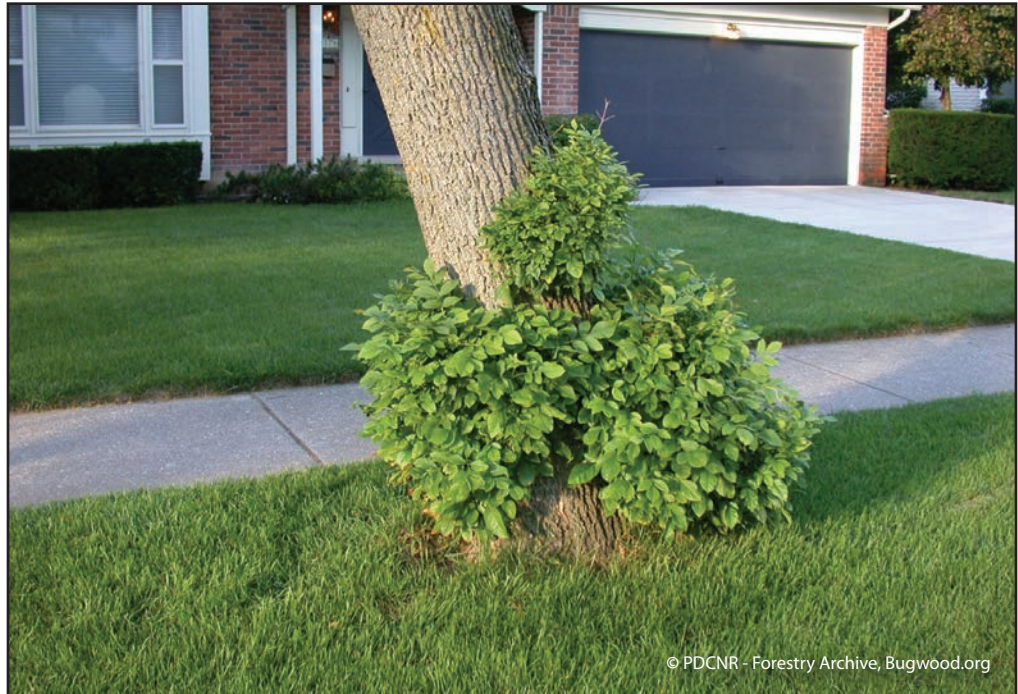
Symptoms and signs of emerald ash borer. Clockwise from top left: Crown dieback and thinning. Early bark splitting. Late bark splitting revealing galleries beneath. Epicormic shoots or suckering. Woodpecker damage (3).