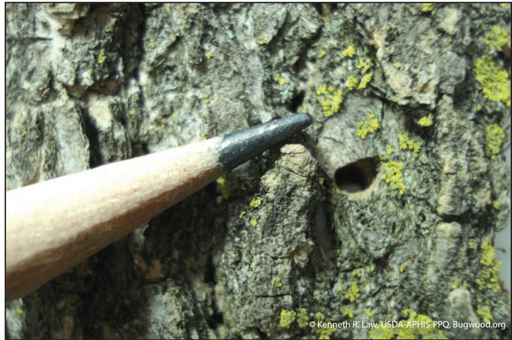
Symptoms and signs of emerald ash borer. Clockwise from top left: Adult emerald ash borer (EAB), Agrilus planipennis . Different instars of larvae. D-shaped exit holes. EAB galleries with larvae. For more information visit www.firstdetector.org