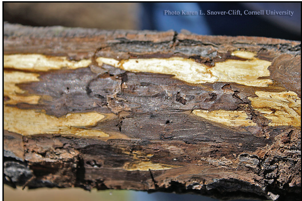
Clockwise from top left: early flagging symptoms on Juglans nigra . Juglans nigra showing more advanced dieback. Bark removed showing walnut twig beetle galleries and coalescing cankers. Juglans nigra branch with walnut twig beetle entrance and exit holes.