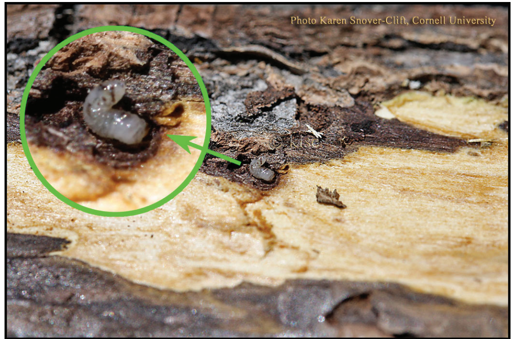
Clockwise from top left: adult walnut twig beetle, Pityophthorus juglandis , in gallery on black walnut. Pityophthorus juglandis adult. Pityophthorus juglandis , walnut twig beetle larva in gallery. Adult walnut twig beetles with penny for scale. For more information visit www.firstdetector.org