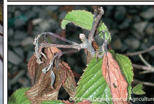
Clockwise from top left: leaf infection spreads along petiole into stem forming a canker (rhododendron); foliar symptoms on camellia; on kalmia; on andromeda; tip blight on viburnum; foliar discoloration on Japanese larch; wilting which leads to twig blight (Douglas fir). For more information on ramorum blight visit www.suddenoakdeath.org/ .