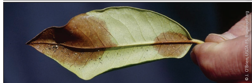
Clockwise from top left: foliar discoloration is common where water collects on the leaf, often at leaf tips (California bay, images 1–2); necrosis along midrib; lesions penetrate leaf—identical pattern front/back; leaf symptoms prominent where water collects (rhododendron, images 3–6).